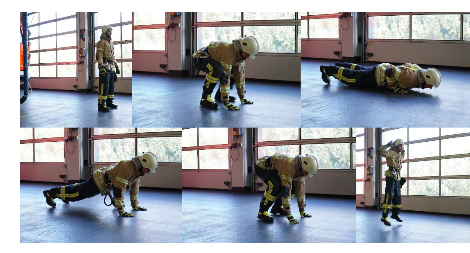
Top 7: Burpees