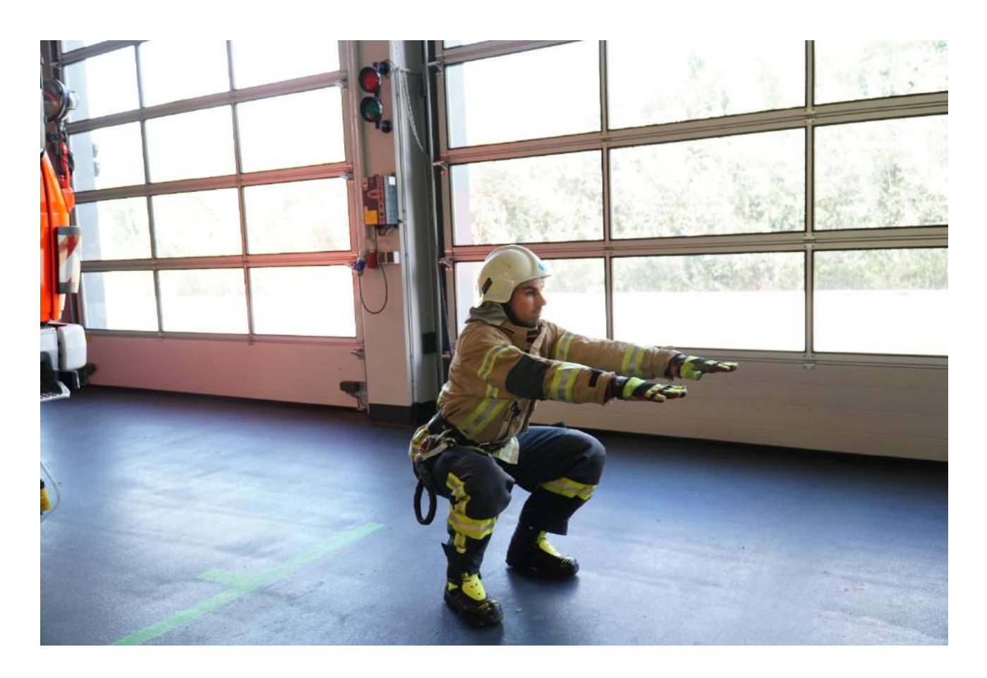
Top 4: Squats