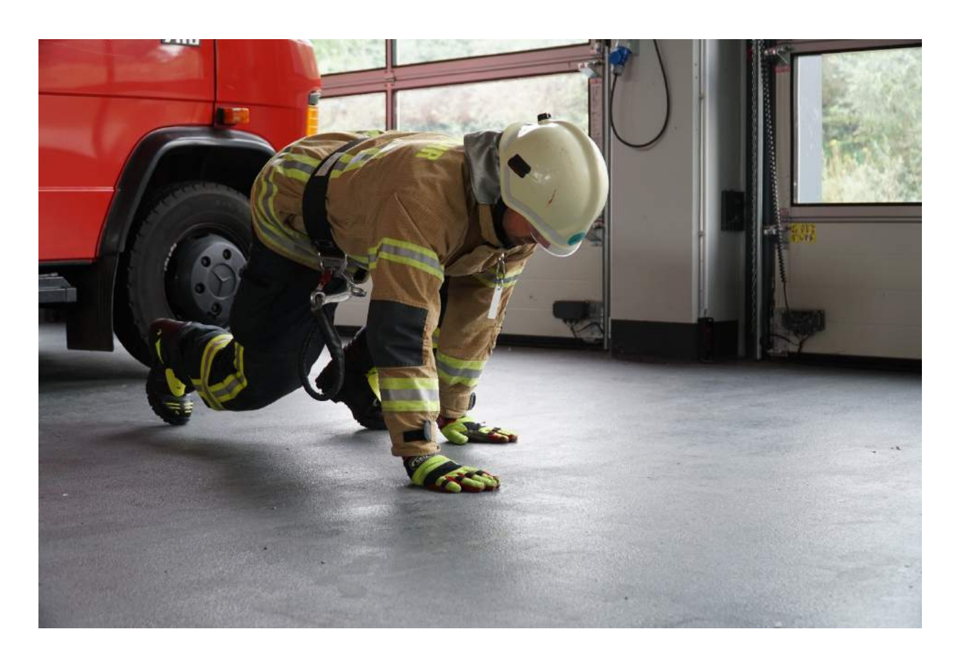
Top 2: Crawling