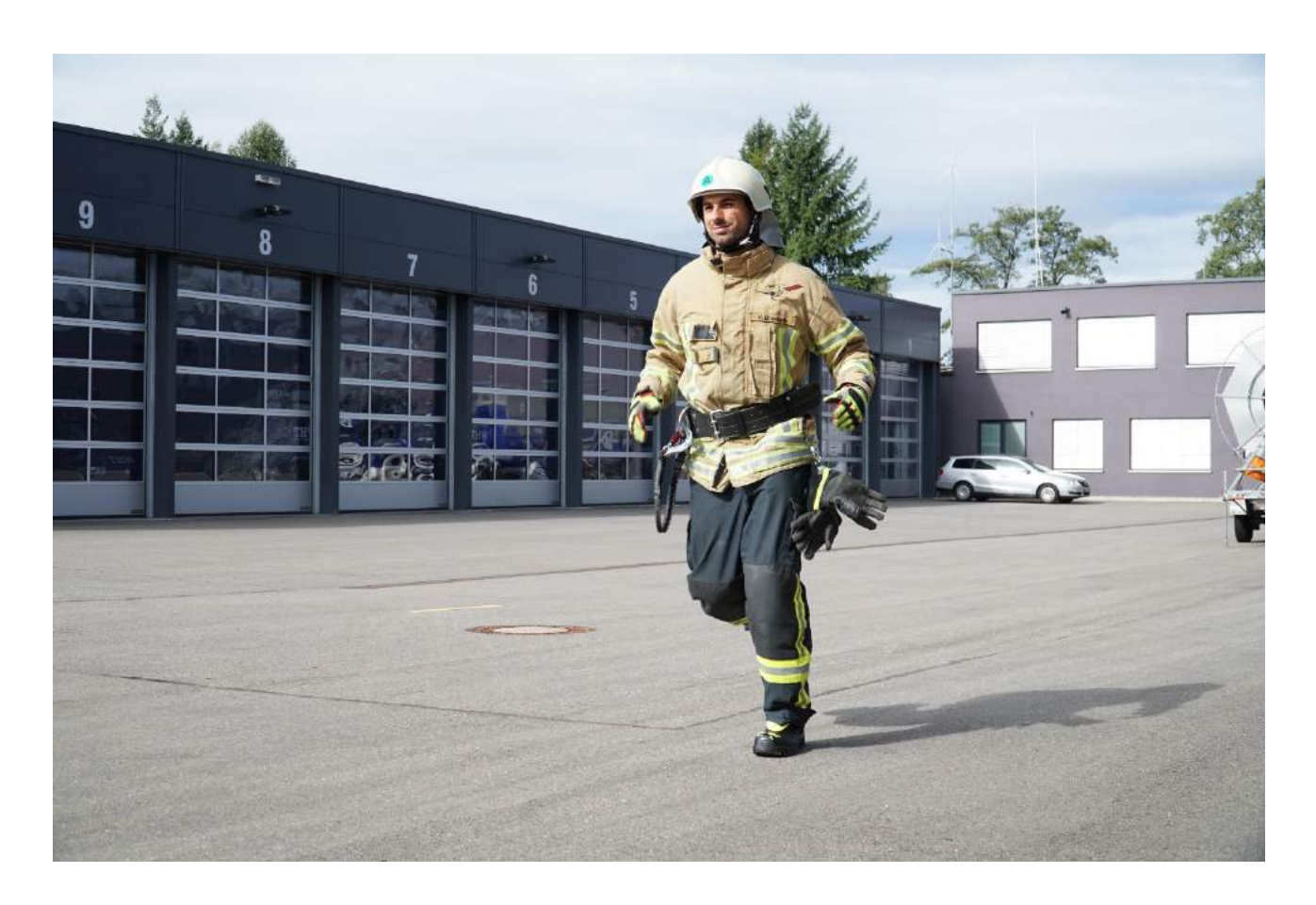
Top 10: Running