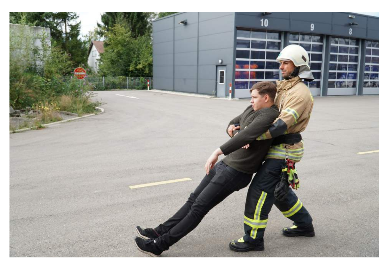
Top 5: Pulling in the diamond handle

- Keep upper body as upright as possible