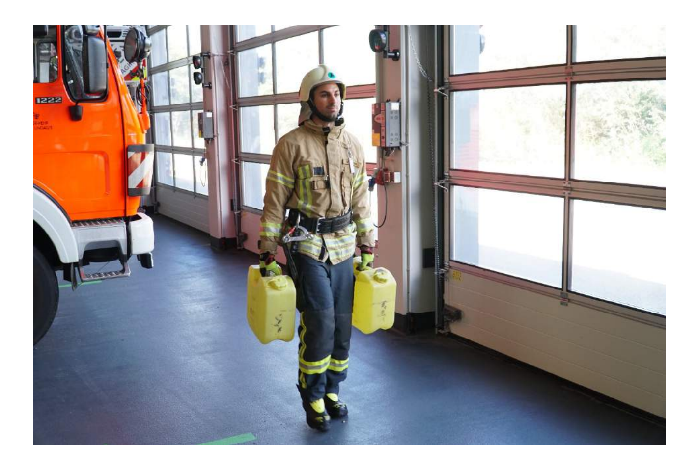
Top 6: Farmer's Walk