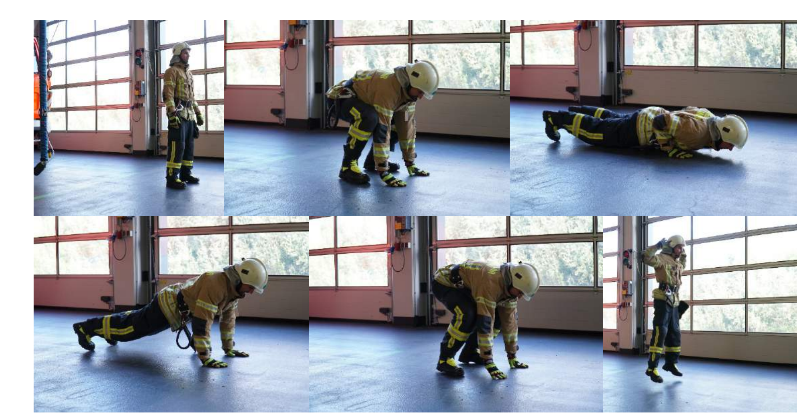
Top 7: Burpees